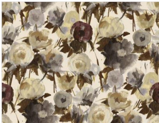
Full width simulation (≈130 cm)