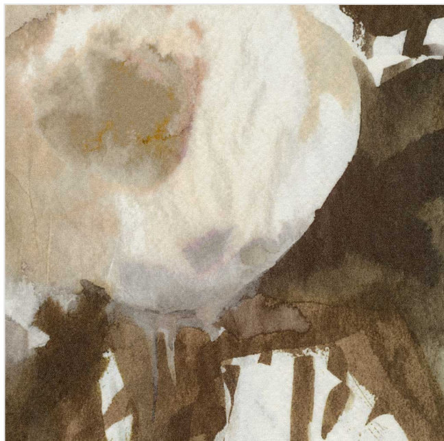
Product scan (≈20x20 cm) or picture