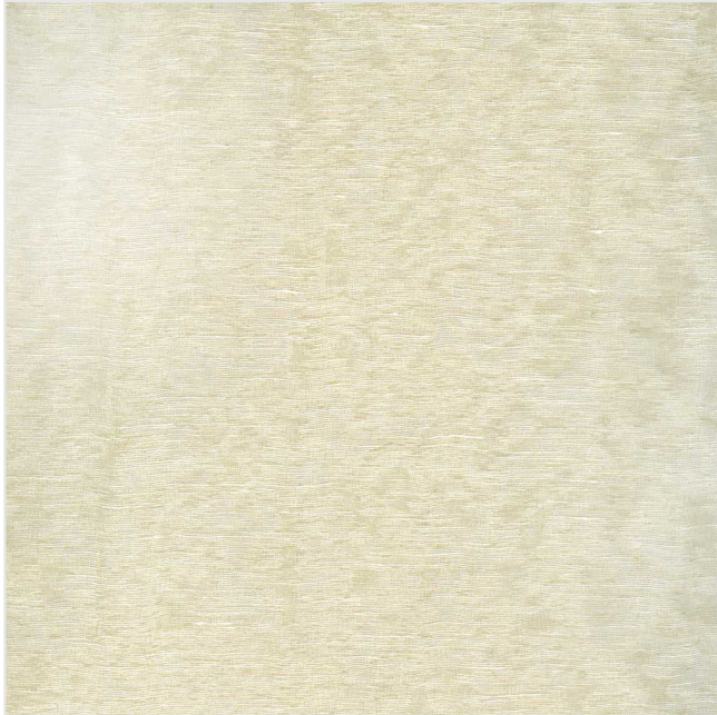
Product scan (≈20x20 cm) or picture