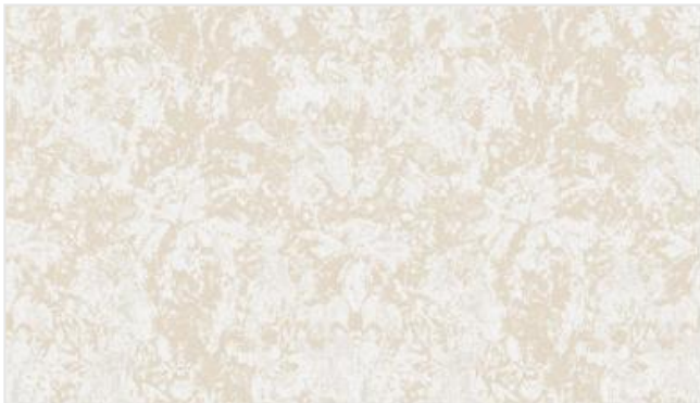
Full width simulation (≈140 cm)