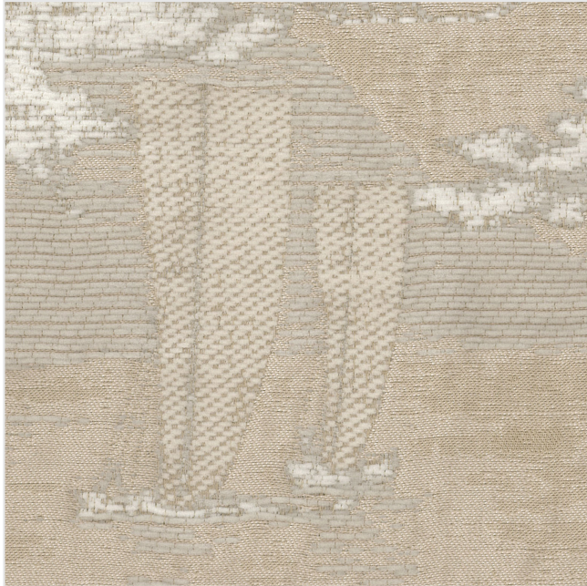
Product scan (≈20x20 cm) or picture