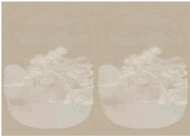
Full width simulation (≈135 cm)